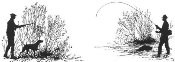
Hamilton/Wenham Rod & Gun Club